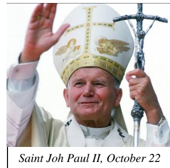
Saint Joh Paul II, October 22

No decisions regarding Christmas Masses will be made until late November. Registering for Masses will be possible beginning early December. Thank you for your patience.